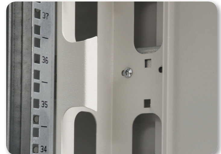
screw-mounting sidely at the traverses (see accessories)